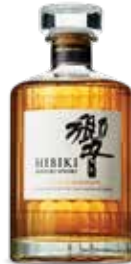
HIBIKI WHISKEY Japanese Harmony H-188