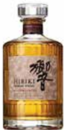
HIBIKI WHISKEY Blended's Choice H-187