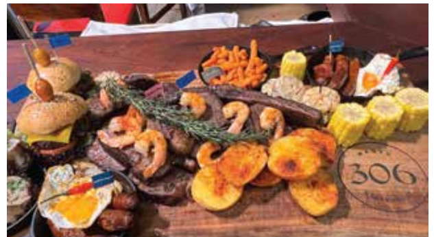
WAG-22 MIX SET For 4-8 People 4 kg

All Prices Are In Usd And Subjected To 10% Tax And 7% Service Fee