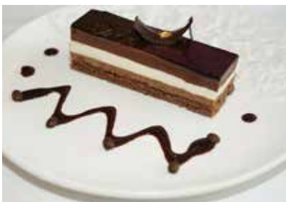
Kh-158 3 Chocolates