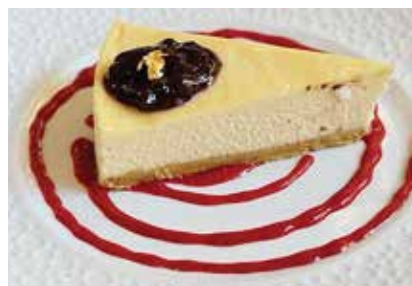
Kh-158 Cheese Cake