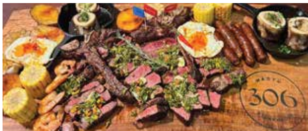
Kh-113 T-Bone Wagyu Australian A-9 2.5 Kg