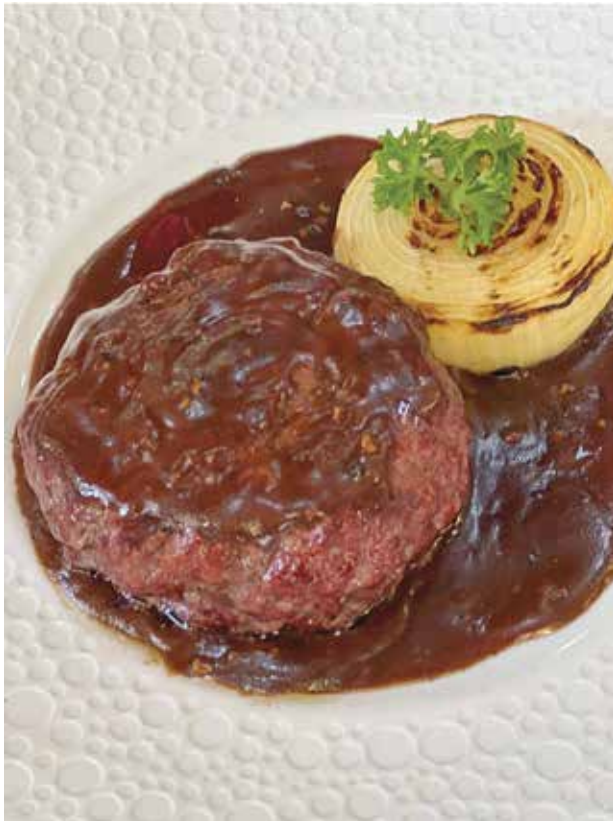
MX-12 Lamb Burger 300 gram $ 40.00