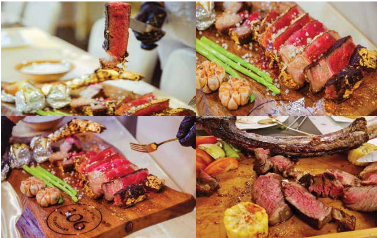
Tomahawk Wagyu Australian