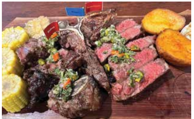
Kh-114 Porterhouse Wagyu Usa A-5 1 Kg