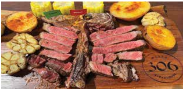
Kh-113 T-Bone Wagyu Australian A-9 1/1.5 Kg