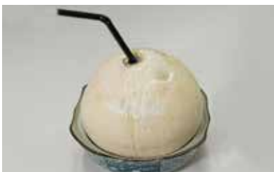
Kh-177 Fresh Coconut