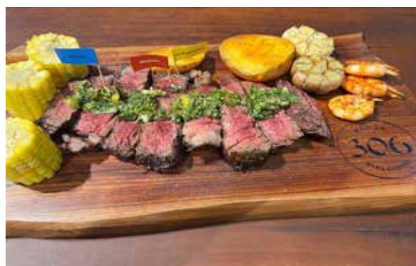
Kh-118 1 kg