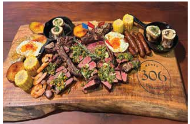
TIB-09 Porterhouse Wagyu 2.5 kg