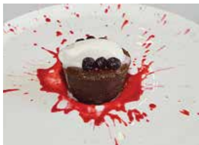
Kh-158 Chocolate milk cuit with Ice Cream