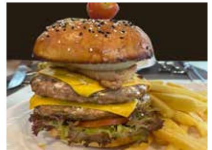
MX-06/07 Black Angus Burger