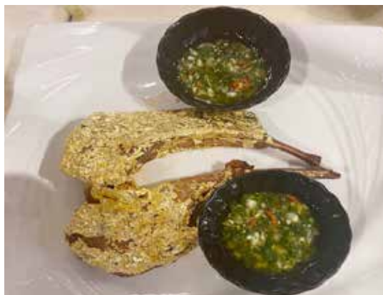
Kh-127 1piece $45