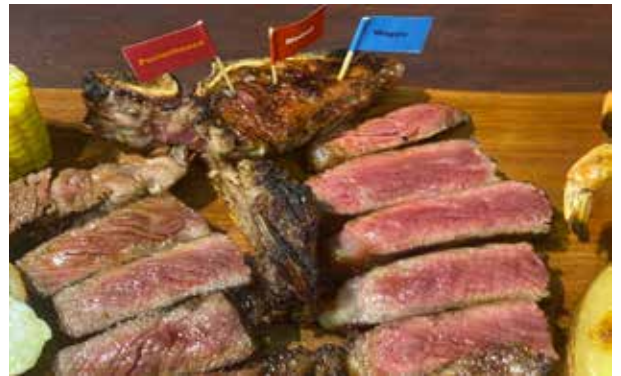
Kh-114 Porterhouse Wagyu Usa A-5 1.5 Kg