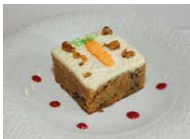
Kh-158 Carrot Cake