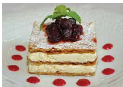
Kh-158 Mille Feuille

Served with whipped cream and cherry on top.