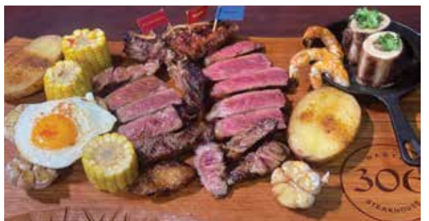
Kh-114 Porterhouse Wagyu Usa A-5 2.5 Kg

All Prices Are In Usd And Subjected To 10% Tax And 7% Service Fee