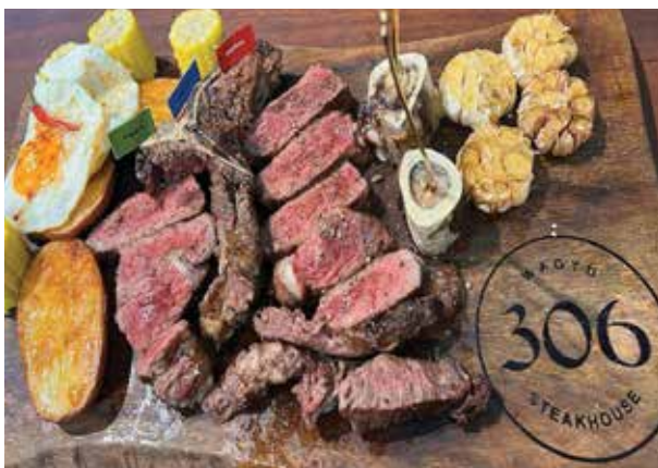
Kh-113 T-Bone Wagyu Australian A-9 2 Kg